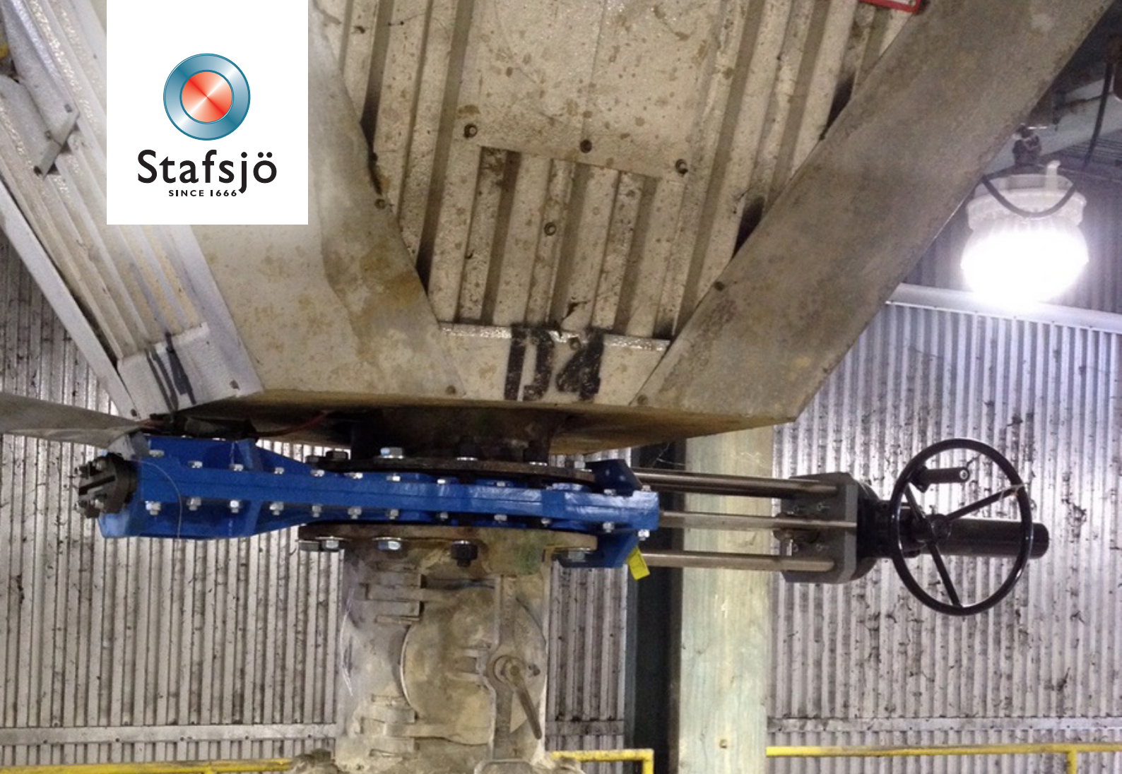
The HG-L installed on a ash hopper