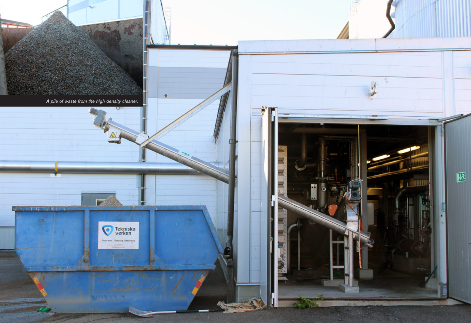
A pile of waste from the high density cleaner.